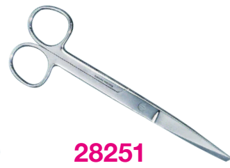
28251 Straight blunt/sharp dissecting scissors