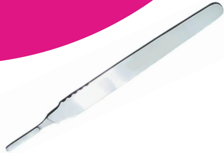
53410 Nickel-plated scalpel handle