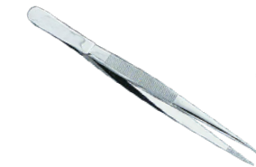
163 Cartilage forceps, straight