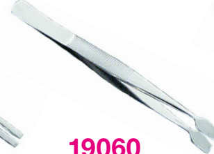
19060 Kuehne coverglass thumb forceps