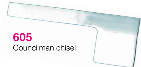
605 Councilman chisel