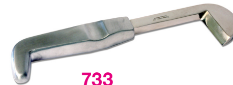
733 Rib cutting knife