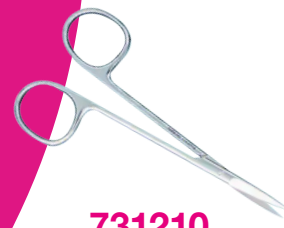
731210 Iris straight scissors