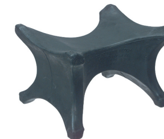
407 Autopsy head rest