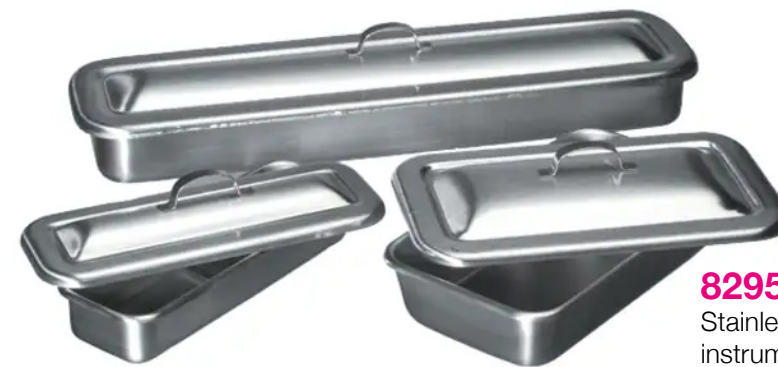
8295 Stainless steel covered instrument trays