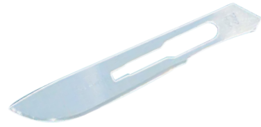
53222 No 22 Scalpel blade

- Electronically polished and cleaned for a high-quality finish