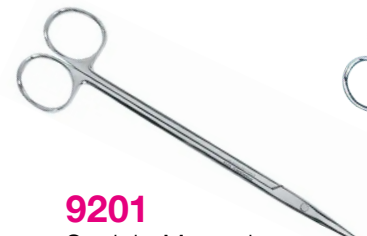
9201 Straight Metzenbaum Scissors