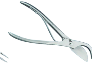
502 Rib shears