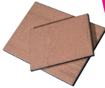
361 Cork Dissecting Board