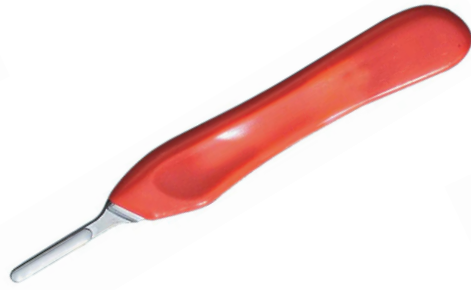
3120027 Plastic scalpel handle