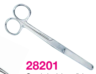
28201 Straight blunt/blunt dissecting scissors