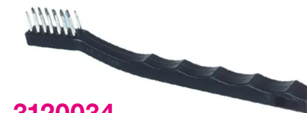
3120034 Stainless steel brush, plastic handle