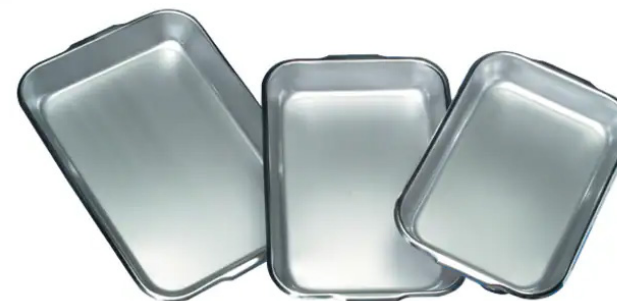
73092 Stainless steel instrument trays