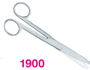
1900 Doyen's Straight Abdominal Scissors