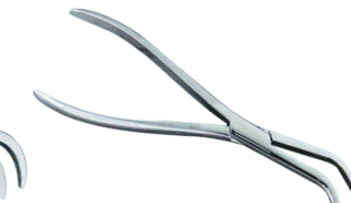
1908 Dura strip forceps