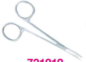
731212 Iris curved scissors