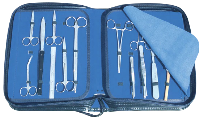
9996969 Instrument case