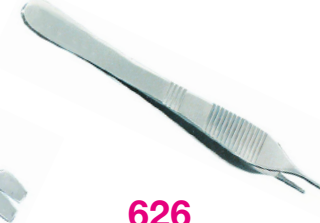
626 Adson fine serrated thumb forceps