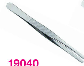
19040 Coverglass thumb forceps