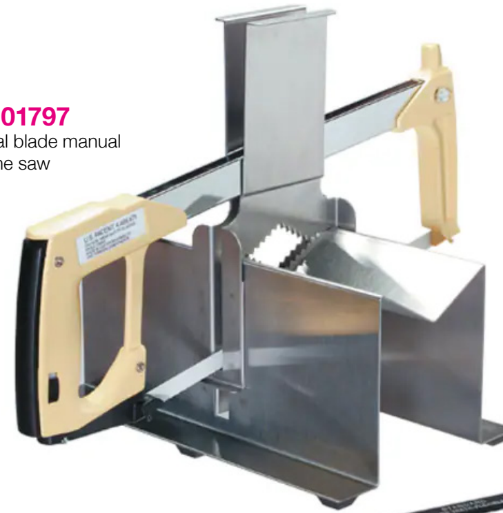
1001797 Dual blade manual bone saw

All saws and chisels are sold by 1 unit per pack unless otherwise noted