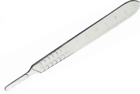
5324 Chrome-plated scalpel handle