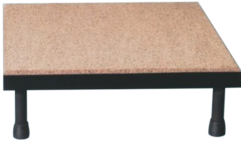
356 Raised Dissecting board