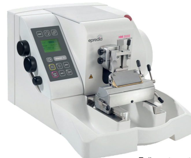
Fully automated HM355S rotary microtome

Optional slide hopper allows for quicker and easier on-demand printing of slides. Slides can automatically feed from the hopper.